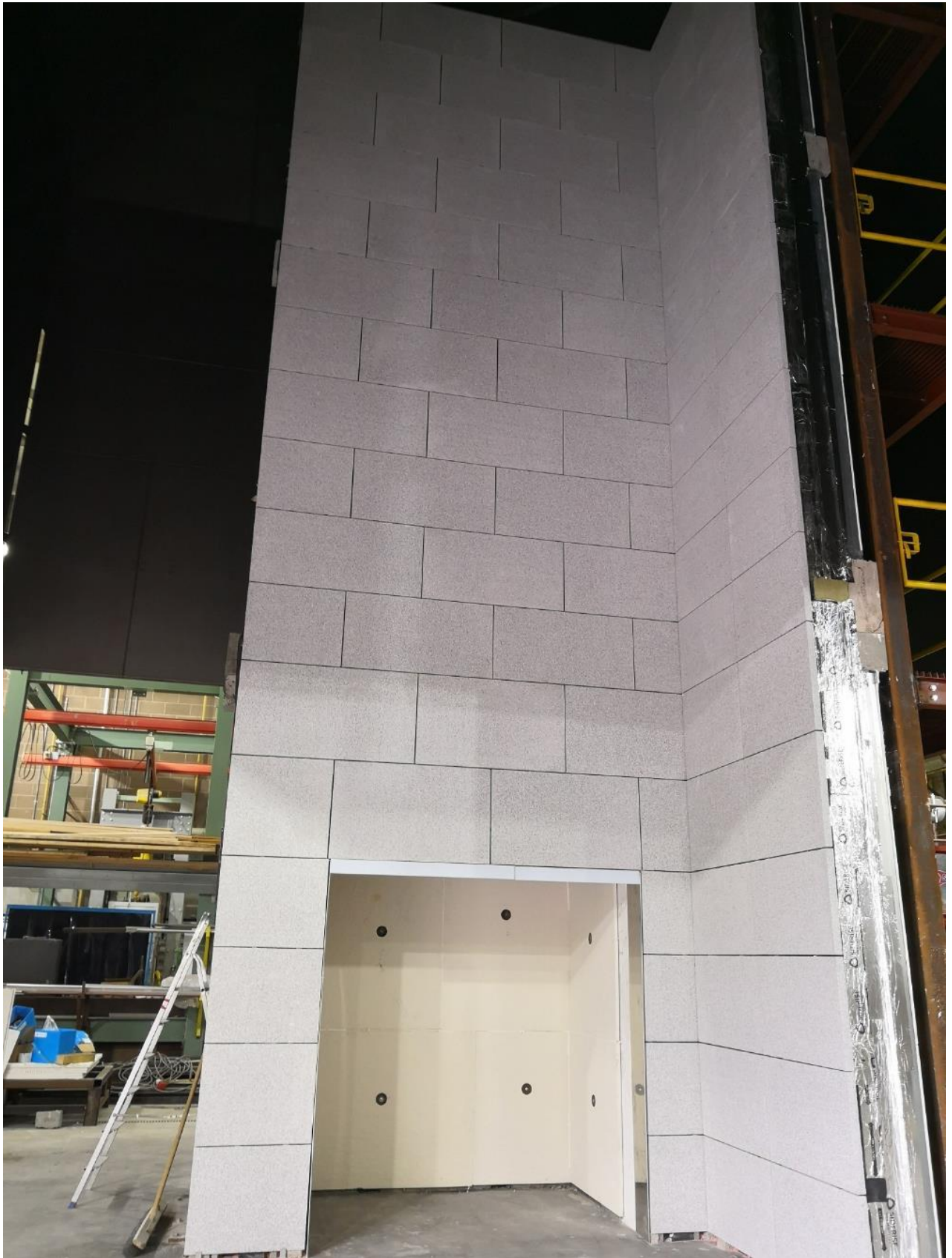
Figure 2. Façade cladding system before starting the test.